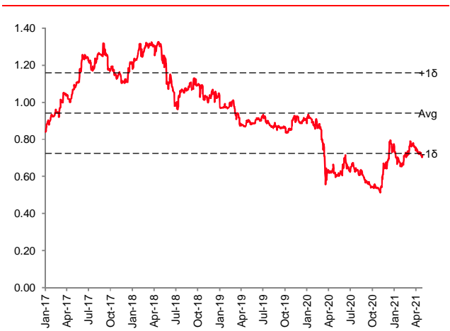
EXHIBIT 2: PB BAND CHART