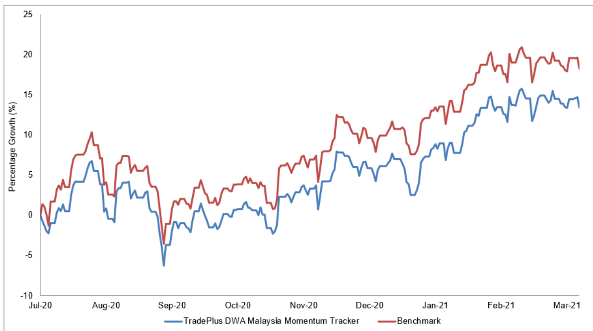
Figure 1: Movement of the Fund versus the Benchmark since commencement.

"This information is prepared by Affin Hwang Asset Management Berhad (AFFINHWANGAM) for information purposes only. Past earnings or the fund's distribution record is not a guarantee or reflection of the fund's future earnings/future distributions. Investors are advised that unit prices, distributions payable and investment returns may go down as well as up. Source of Benchmark is from Bloomberg."