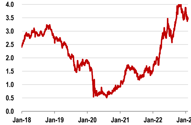
Exhibit 6: UST10Y