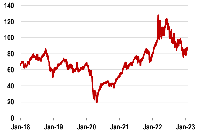
Exhibit 3: Brent