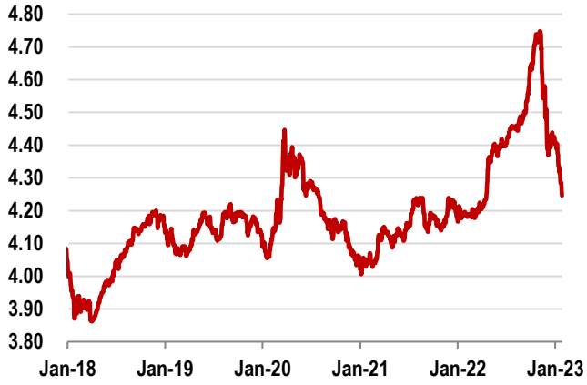
Exhibit 1: Dollar Index