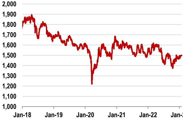
Exhibit 4: FBM KLCI