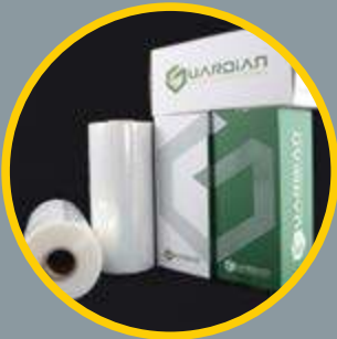
MACHINE WRAP STRETCH FILM