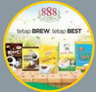
TEA & COFFEE BEVERAGES