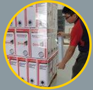
HAND WRAP STRECTH FILM