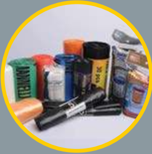
GENERAL BAGS, FILMS & SHEETS