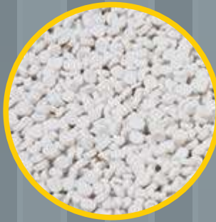
CALCIUM CARBONATE COMPOUNDS